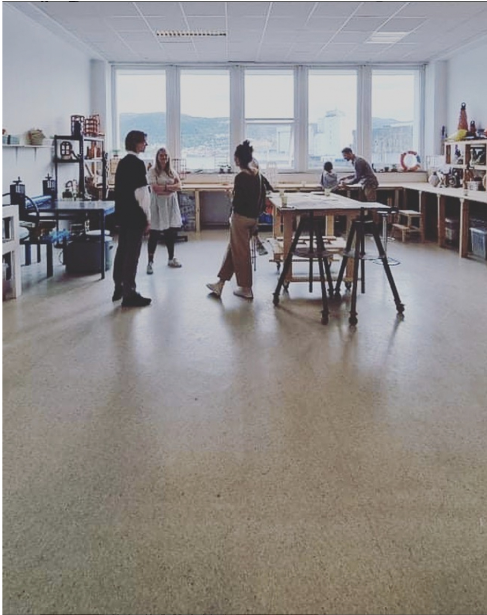
B-Open, September 2021.